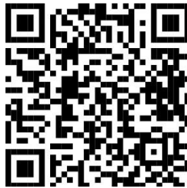
QR code to access instructional video

After your discharge from Royal Perth Hospital all brace inquiries should be directed to South Metropolitan Orthotics Department Phone: 6152 7450.