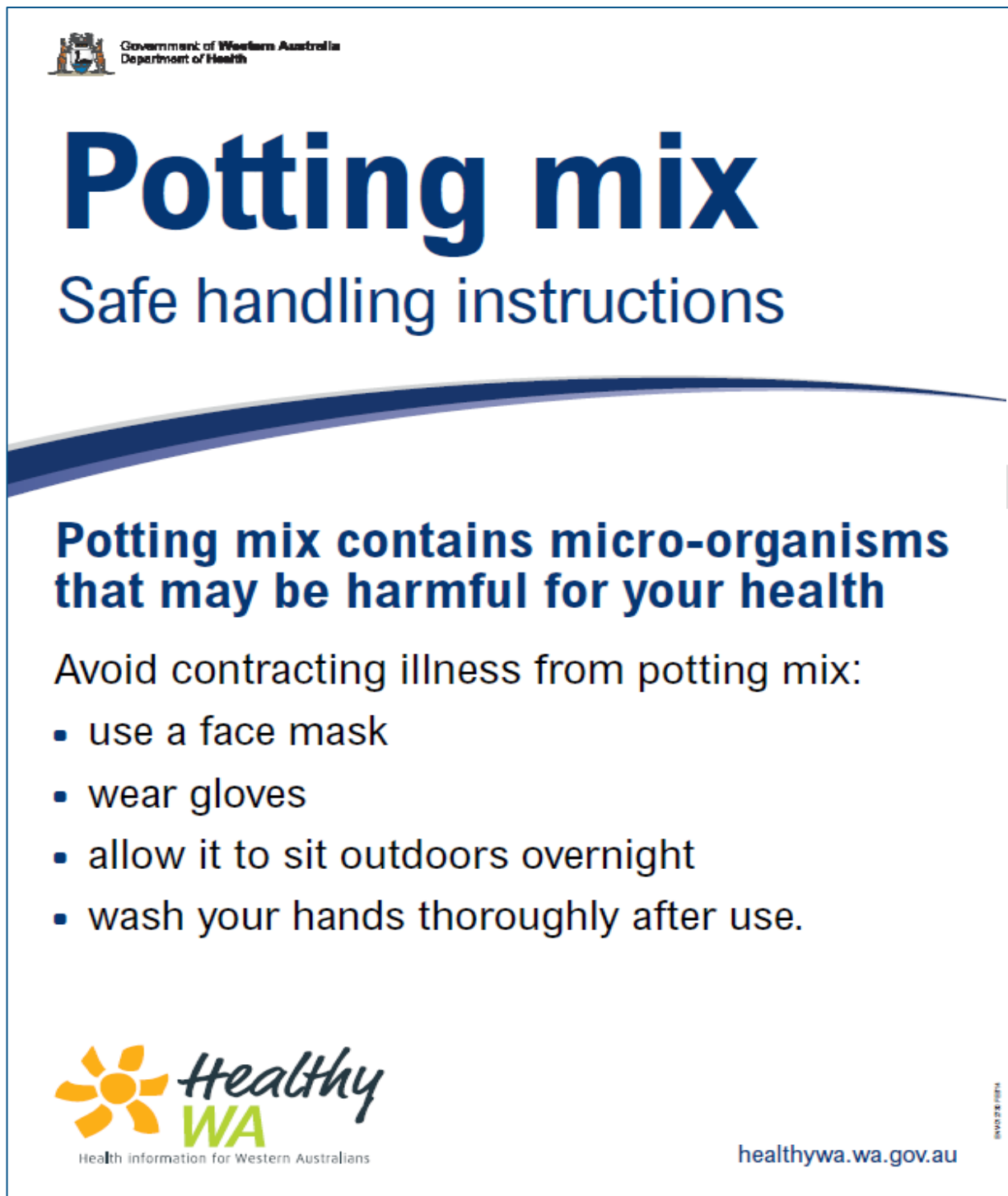
Figure 2 DOH posters advising the public on the safe handling of garden soils