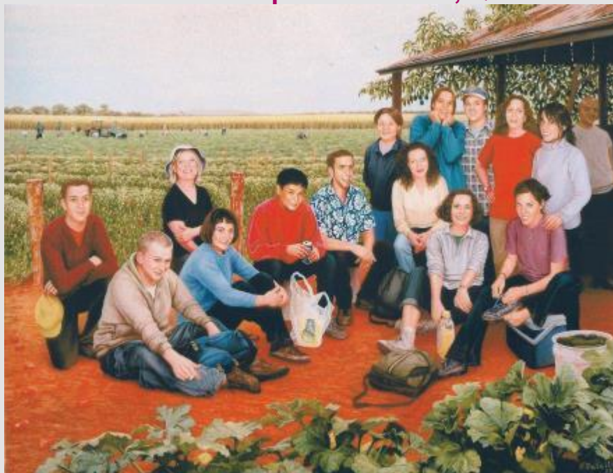
Figure 1 the portrait in oils "Taking a break in the field" by Josonia Palaitis (depicts the 15 backpackers killed in the Childers fire).

In June 2013, a deliberately lit fire burnt down the Palace Backpackers Hostel, in Queensland. Fifteen people died in the fire.