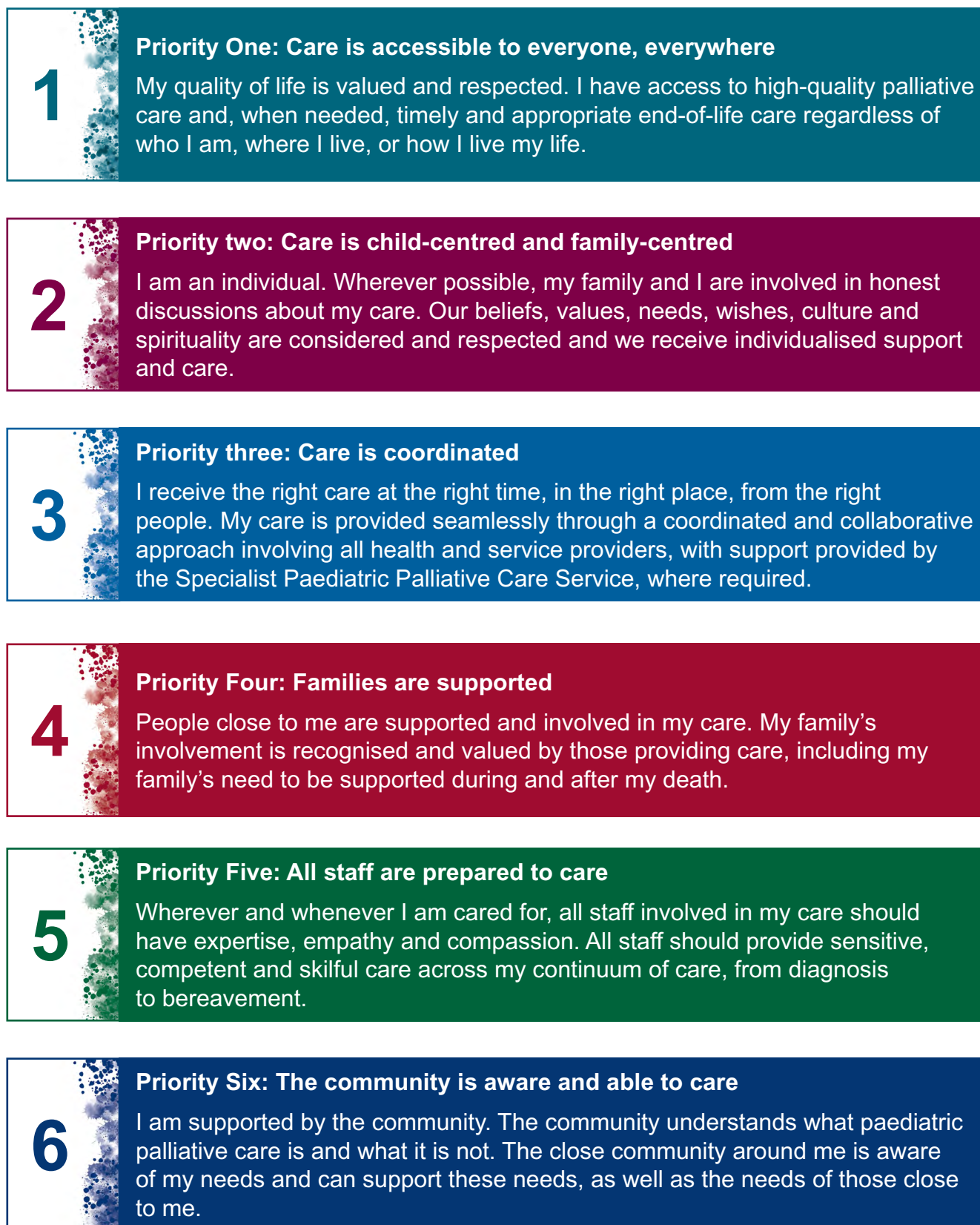
Figure 1: Overview of the priorities from the child's perspective*

*It is important to recognise the wider family/caregivers of each child; whilst this may vary considerably for each child, their involvement is implicit.