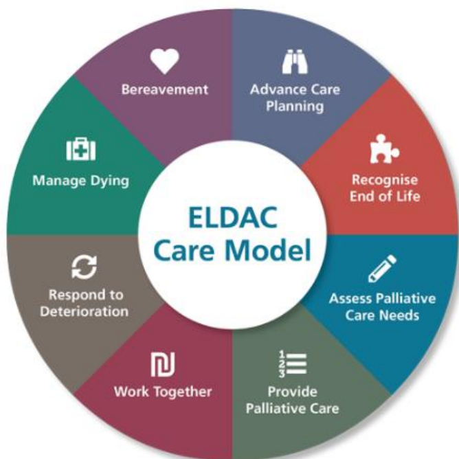
Figure 2. End of Life Directions for Aged Care (ELDAC) Care Model

The End of Life Directions for Aged Care (ELDAC) Care Model below, Residential Aged Care: Excellence in Palliative Care Communicate (RACEPC) Communicate and Palliative Care Outcomes Collaboration (PCOC) Aged Care Outcomes program may be suitable and have synergies with RGoC implementation.