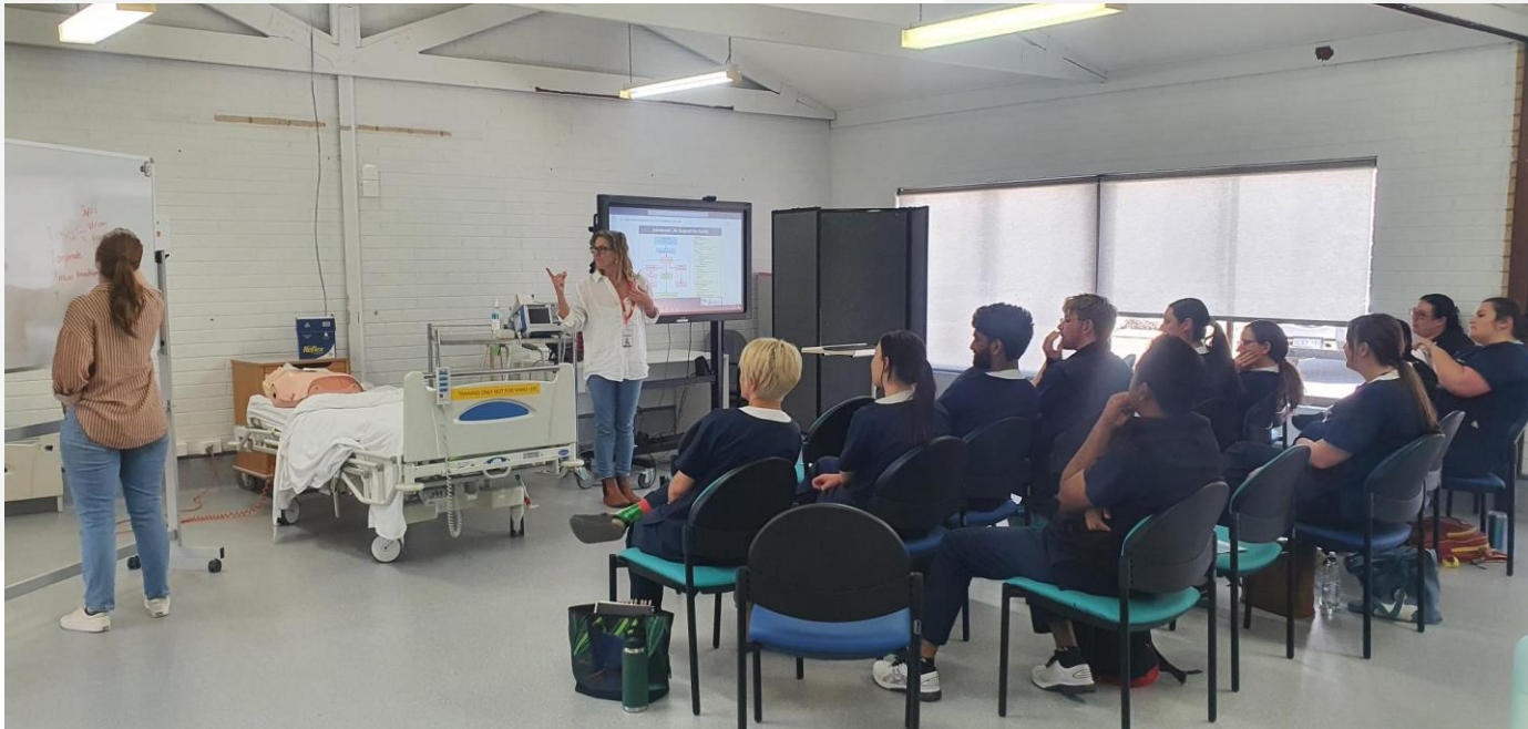
Graduate Orientation Week, South West

All nurses in a WACHS Graduate Program receive support and education to develop skills and promote professional growth. Programs include orientation, study days and support throughout each program. Plus the Backup Nurse Support Team.