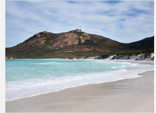
The Ningaloo Coast

The Midwest also offer two-specialist 18-month programs , specialising in ED and HDU, and a specialist 12-month perioperative nursing program.